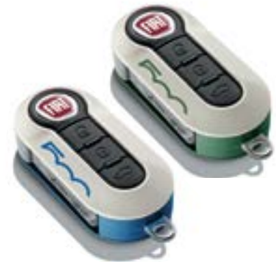
Set of 2 covers, white/blue Italy, white/military green.