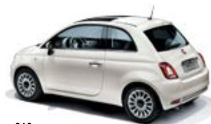
268 GELATO WHITE