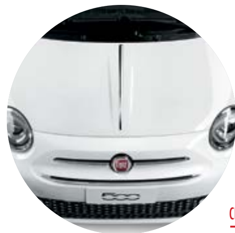
CHROME-PLATED BONNET LINE