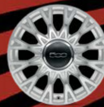
16" ALLOY WHEELS white painted with diamond finish (opt. STAR)