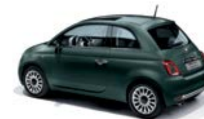
421 - AVAILABLE ON ROCKSTAR ONLY PORTOFINO GREEN