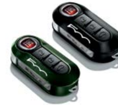
Set of 2 covers in british green and pastel black.