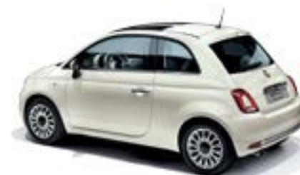
227 GHIACCIO WHITE