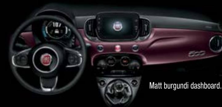
Matt burgundi dashboard.