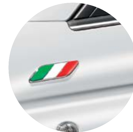
ITALIAN FLAG BADGE ON FRONT FENDER

Stripes for bonnet and roof. Not compatible with sunroof version.