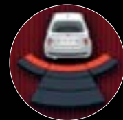
REAR PARK ASSIST

Depending on the version of your Fiat 500 , the TFT display is available with two different basic graphics and it also changes appearance with the driving mode set: Normal, Sport or Eco . Even the Rear Park Assist display will be customised according to your 500 model, while can control the tyre pressure with the TPMS function whenever you like.