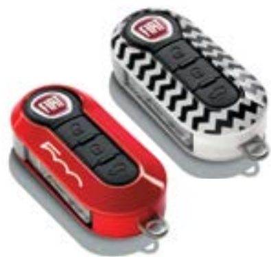
Set of 2 covers, red coral and chevron graphics.