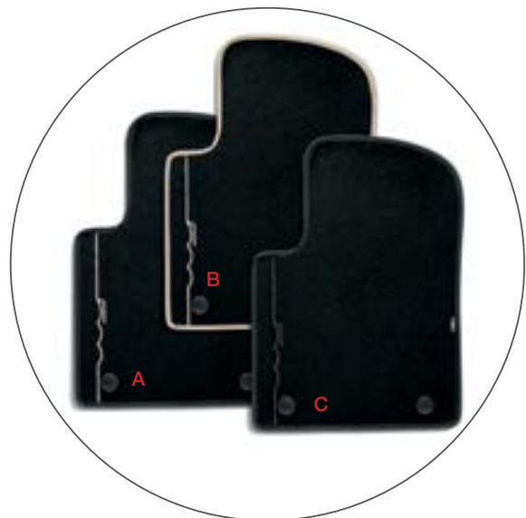
BLACK CARPET MATS - A

Set of 4 mats with black edge, ivory 500 logo and Italian flag. 2 pins security system.