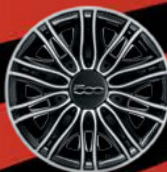
15" STYLED WHEELS (opt. POP)