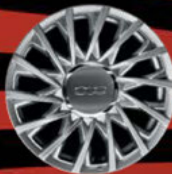
15" ALLOY WHEELS glossy silver (LOUNGE, opt. STAR)

As demonstrated by the alloy rims from which you can choose to complete and put your own unique stamp on a car which knows when there is no point in chasing perfection, when it can already be reached. And perhaps even surpassed.