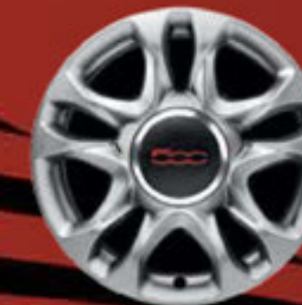
15" ALLOY WHEELS glossy silver (SPORT)