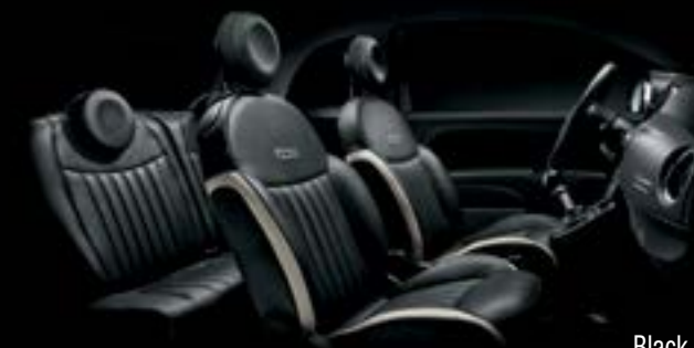
Black Frau leather with ivory colour leather inserts. Contrasting ivory embroidered 500 logo.

500 ROCKSTAR • New black pinstripe technoprene fabric seats with techno leather details • Matt green Dashboard • Specific Black Techno leather steering wheel with Satin Chrome insert.