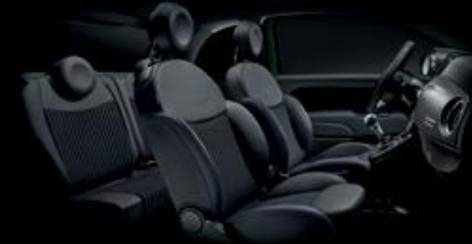
New blue pinstripe technoprene fabric seats with techno leather details.