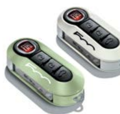
Set of 2 covers in light green and pastel white.