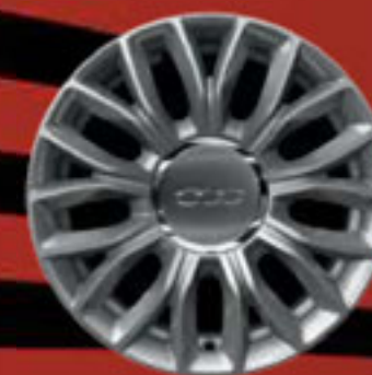
15" ALLOY WHEELS glossy silver (opt. LOUNGE)