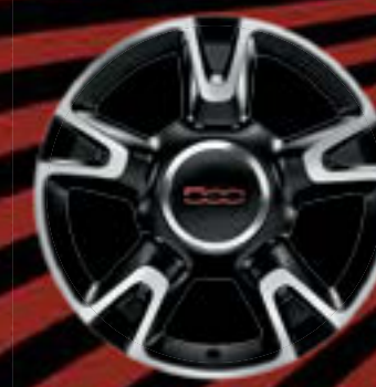
16" ALLOY WHEELS Matt black painted with diamond finish (opt. ROCKSTAR)