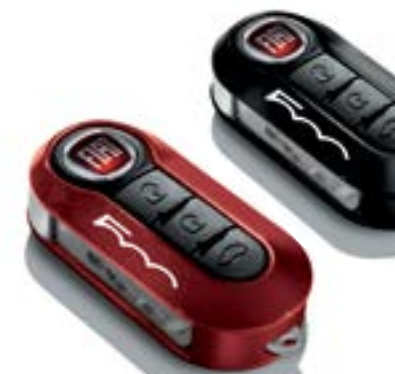
Set of 2 covers in metallic red and pastel black.