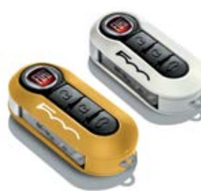
Set of 2 covers in orange and pastel white.