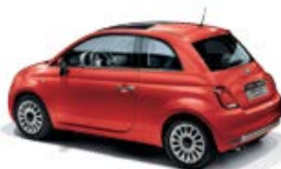
552 CORALLO RED