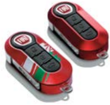
Set of 2 red covers, one with the Italian flag graphics.