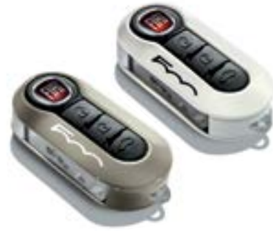
Set of 2 covers in beige and pastel white.