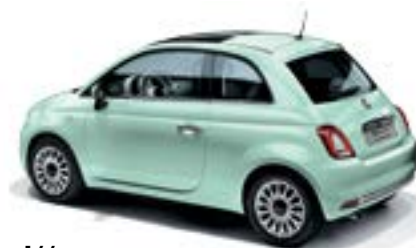
166 LATTEMENTA GREEN