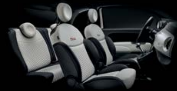
New white sand Matelassè fabric seats with techno leather details.