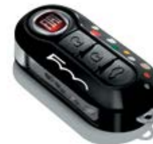
Single, black with colored dots.