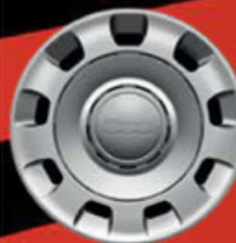
14" GREY HUB CUPS (POP)