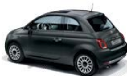
735 CARRARA GREY