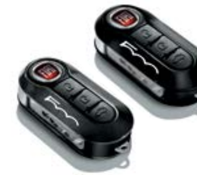
Set of 2 covers in dark grey and pastel black.