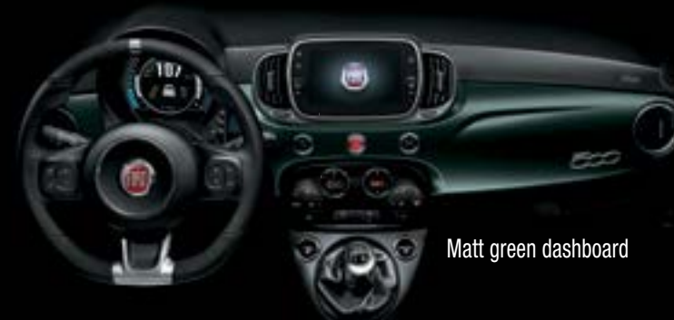
Matt green dashboard