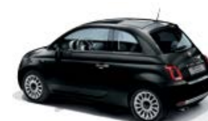
876 VESUVIO BLACK