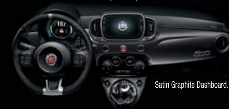
Satin Graphite Dashboard.