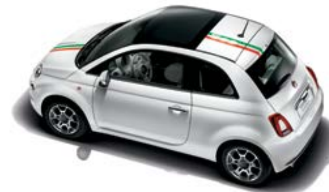
500 ITALY STRIPES

Stickers for doors, front and rear fender.