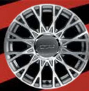
16" ALLOY WHEELS glossy silver (STAR)