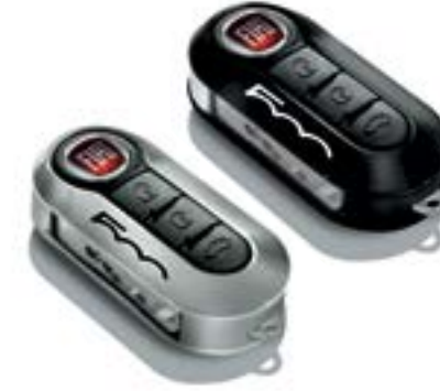
Set of 2 covers in light gray and black.