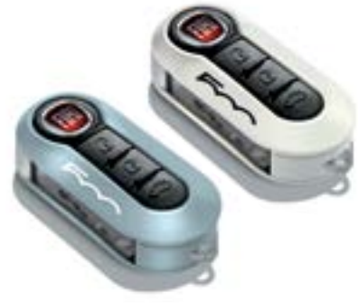
Set of 2 covers in light blue and pastel white.