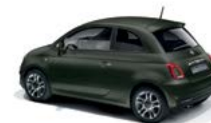
149 - AVAILABLE ON SPORT ONLY ALPI GREEN