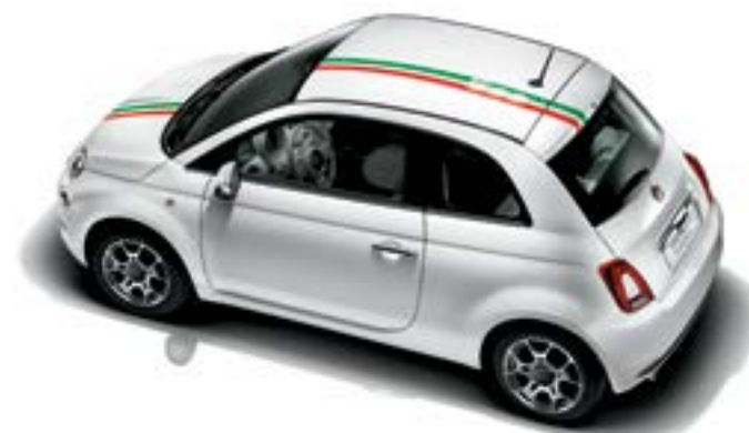
500 ITALY STRIPES

Stripes for bonnet and roof. Compatible with sunroof version.