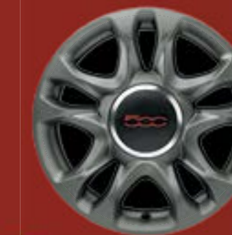
15" ALLOY WHEELS Satin Graphite finish (opt. SPORT, ROCKSTAR)