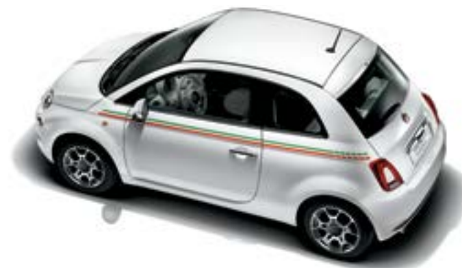
ITALY SIDE STRIPES

Stickers for doors, front and rear fender.