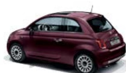
866 OPERA BORDEAUX