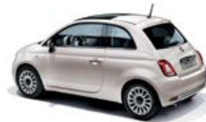
494 - AVAILABLE ON STAR ONLY STELLA WHITE