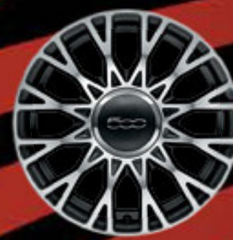
16" ALLOY WHEELS black painted with diamond finish (opt. STAR)