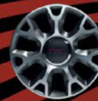
16" ALLOY WHEELS diamond finish (ROCKSTAR)