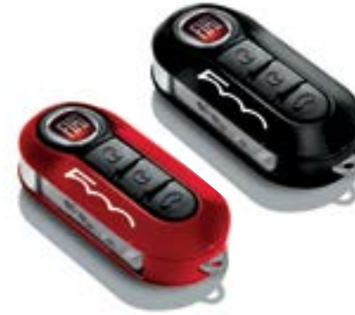
Set of 2 covers in red and pastel black.