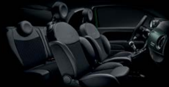
New black pinstripe technoprene fabric seats with techno leather details.