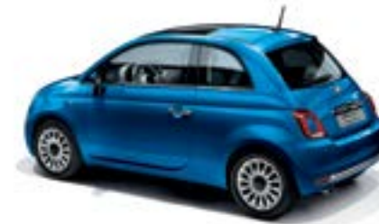
425 ITALIA BLUE