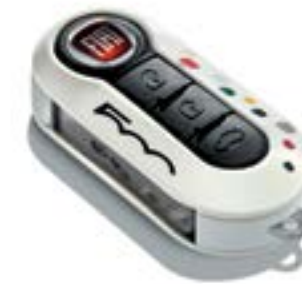
Single, white with colored dots.