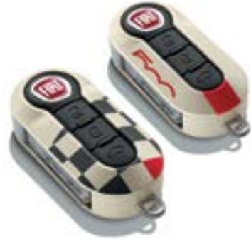
Set of 2 covers with chequered flag and 500 logo.