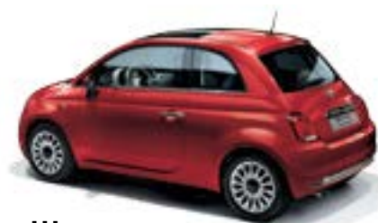
111 PASSIONE RED