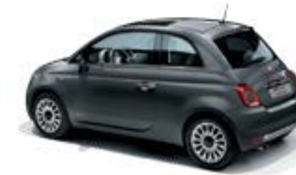
695 POMPEI GREY