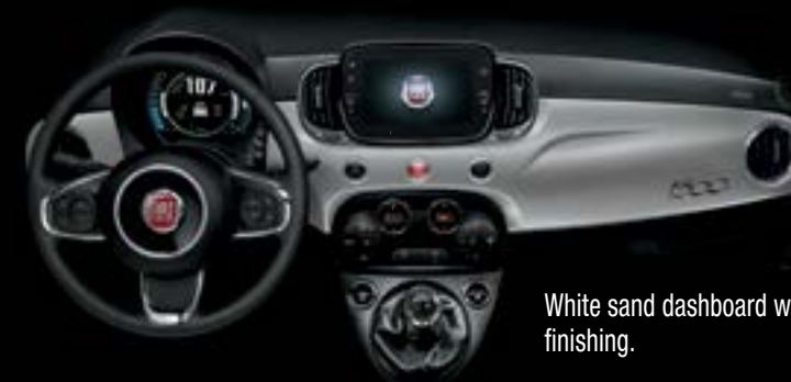
White sand dashboard with pearl finishing.