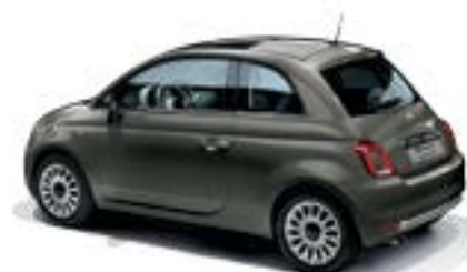
372 COLOSSEO GREY