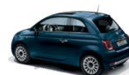
687 DIPINTO DI BLU BLUE